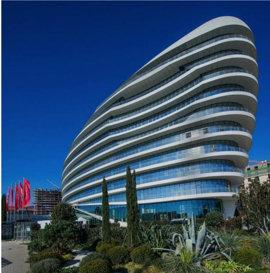
White City Office Building