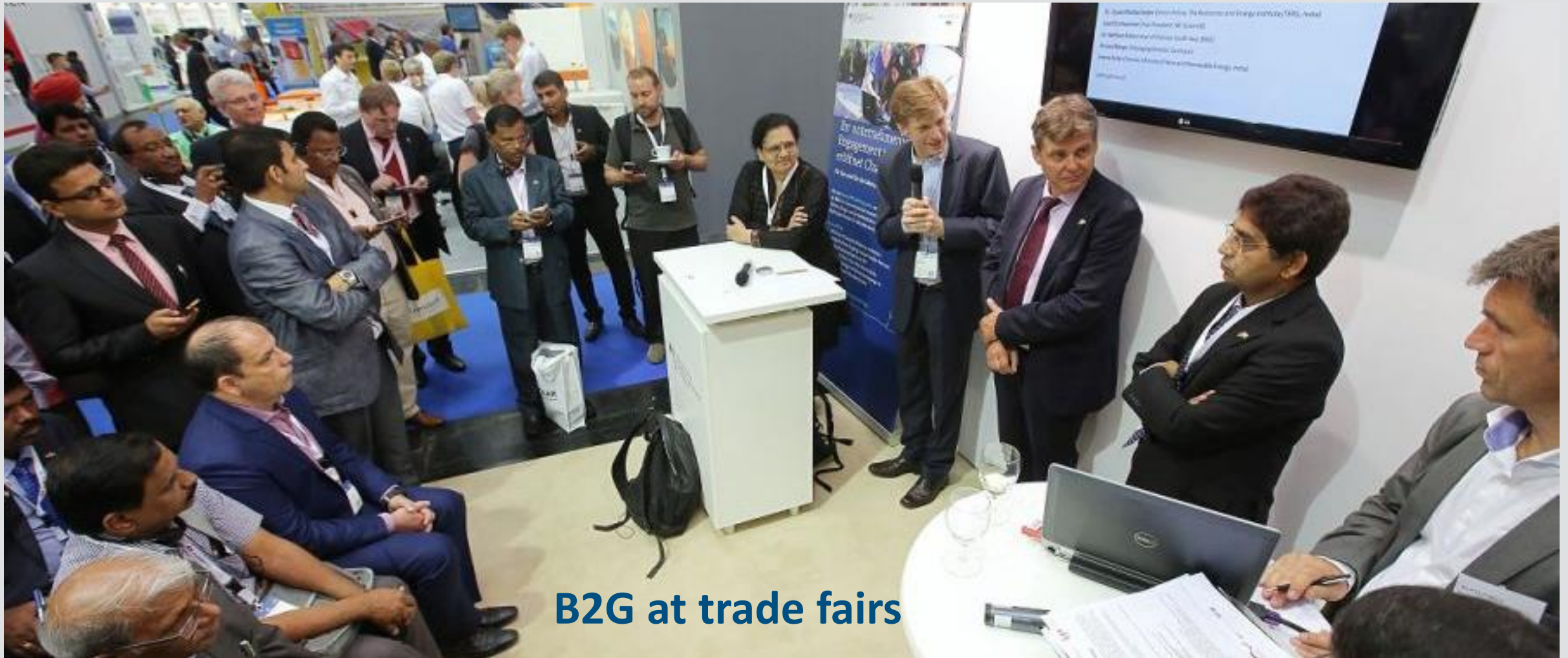
B2G at trade fairs