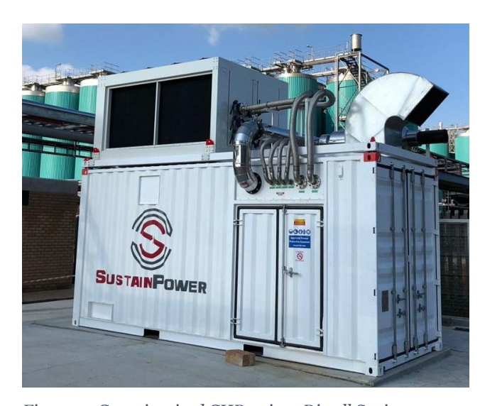
Figure 3: Containerised CHP unit at Distell Springs

Distell, a global beverage company with a wide range of award-winning brands, such as Amarula, Savanna, Hunter's Dry, and many others, continues to ramp-up its sustainability efforts. A CHP unit from SustainPower was installed in 2019 at its Springs cider manufacturing operation to convert the effluent treatment plant's biogas into power. This is the first step to making the effluent treatment plant energy-neutral in the short-term and energy-positive in the future.