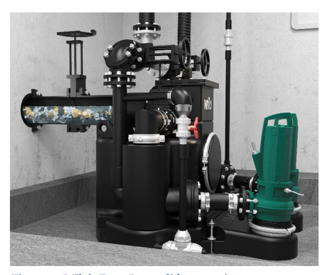
Figure 2: Wilo's Emu-Port solid separation systems

The solid separation system has resulted in a 15% to 25% saving in power consumption while reducing maintenance costs by more than 60%.