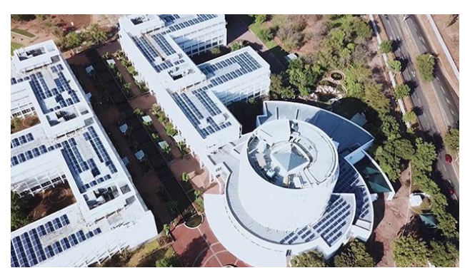
Figure 5: Embedded energy system at Siemens Midrand campus

The Siemens Campus Micro-grid was borne out of necessity, as an analysis of electricity costs, tariffs, energy security and the additional diesel costs incurred by powering a back-up diesel generator revealed escalating prices, unclear billing, high-energy use, large ecological footprint and of course power disruptions due to load shedding.