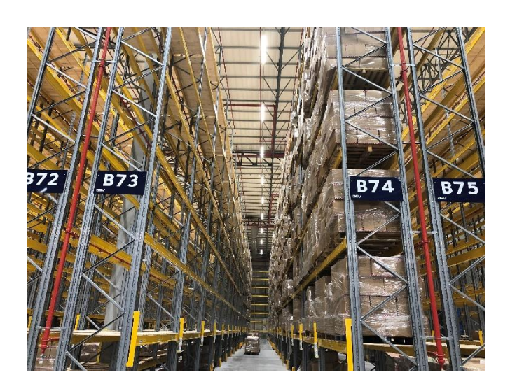
Figure 4: Lighting installation at DSV Park Gauteng e Steinel SA

DSV Park Gauteng is the largest logistics facility of its kind in Africa. The logistics centre consists of approx. 130,000 m<sup>2</sup> of buildings and covers supply chain solutions from first to last mile controlled and managed under one roof. The sprawling complex houses a logistics warehouse of 79,000 m<sup>2</sup>, a cross-dock facility of 41,000 m<sup>2</sup> and office space of 10,000 m<sup>2</sup>.